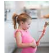
Media and Its Impact on Youth